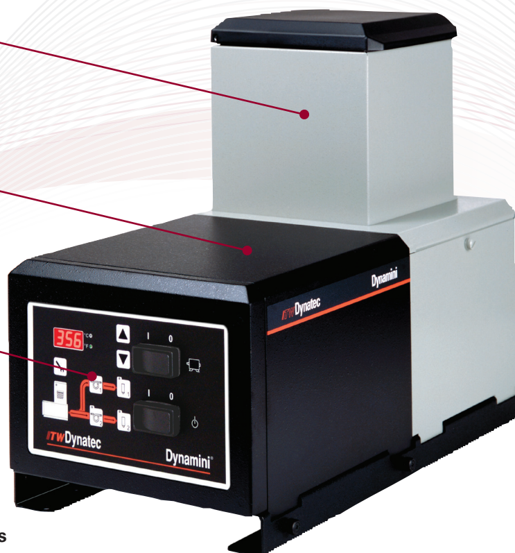
ITW Dynatec - Dynamini™ Series Models: N05, N10, & N22

Icon-driven control panel simplifies operations.