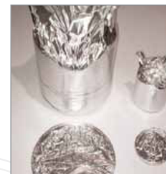
Full and "spent" adhesive bags