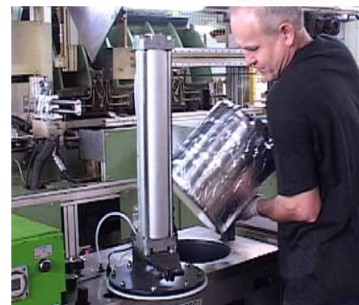
Inserting a new bag or "slug" of adhesive into the melt unit