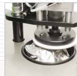
Platen assembly above feed tube