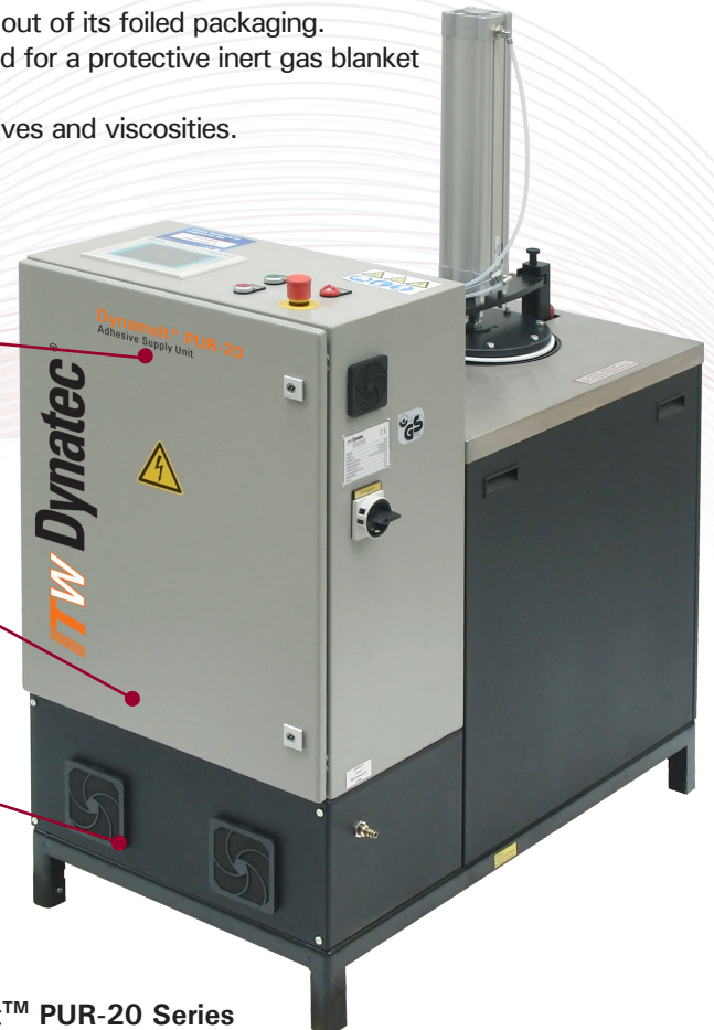
ITW Dynatec - Dynamelt™ PUR-20 Series

Integrated adhesive reservoir eliminates the need to shut down the system when changing bags.