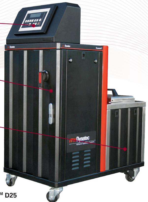
ITW Dynatec - Dynamelt™ D25

Melt-On-Demand hopper extends adhesive life and performance.