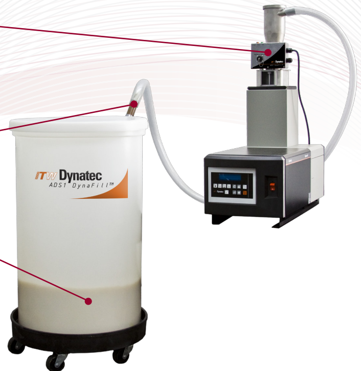
ITW Dynatec - ADS1 DynaFill™ Shown with optional caster base.

Adhesive supply levels are automatically maintained with a sealed system that virtually eliminates system contamination.